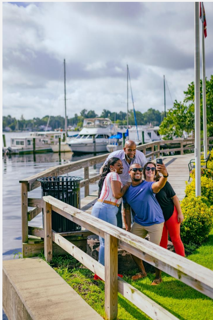
Behind the scenes